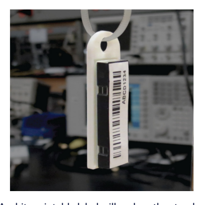
A white printable label will replace the standard black label when a printable label is required.